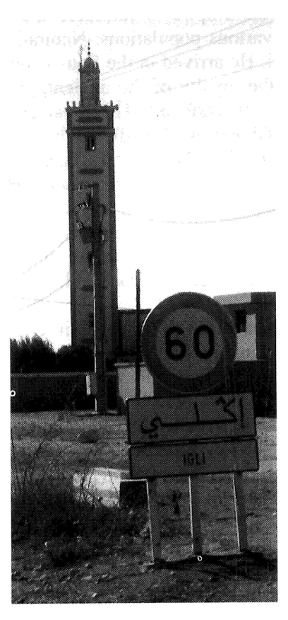
Figure 2. The road sign for modern Igli, 30 km East of Tarūdant

Igli today is a moderately sized village, probably housing some 1000 people dedicated to agriculture, the oil press and animal husbandry. Although many ancient agricultural practices remain, including the cultivation and pressing of olives and the production of Argan oil, the present-day site of Igli has gone through several generations of renovation. The so-called mosque of Ibn Tūmart, for example, looks very little like its probable Almohad original. There are several decaying kubbas, the «Zāwiya of Tiylina», in the village that seem to be at least from the Merinid or Saadian period, very possibly they