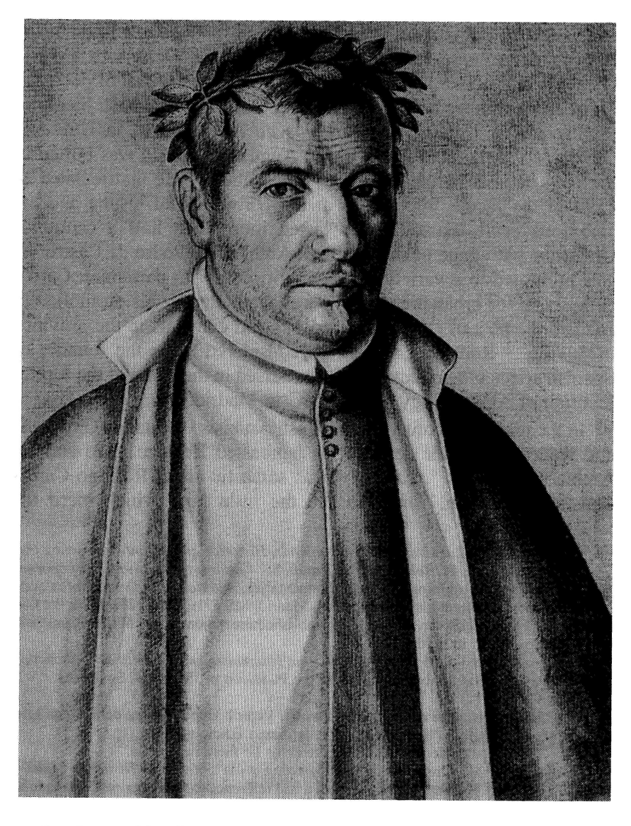
Potrait of Rodrigo Caro from the Pacheco Manuscript in the Biblioteca Lázaro Galdiano (Madrid)